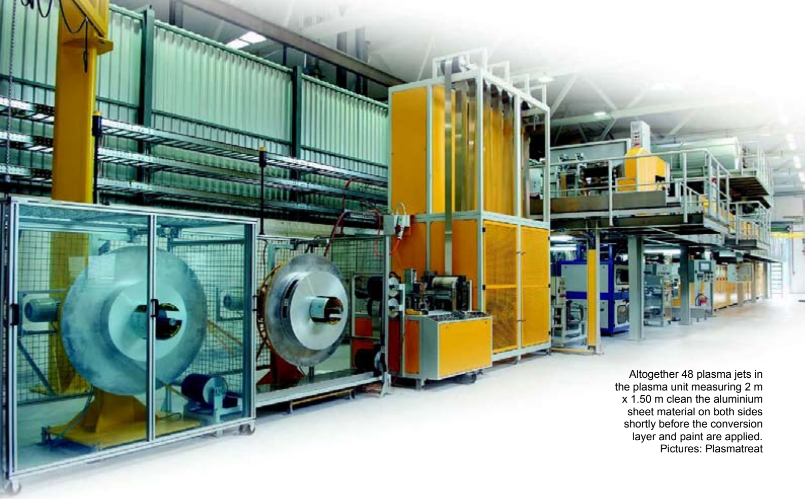
Altogether 48 plasma jets in the plasma unit measuring 2 m x 1.50 m clean the aluminium sheet material on both sides shortly before the conversion layer and paint are applied.

cleaning and activating surfaces for coil coating. In the tests conventional chemical pretreatment was used as a reference system. Taking account of the material-plasma parameters to be optimised (plasma focus, intensity or energy input level) the plasma system proved to be