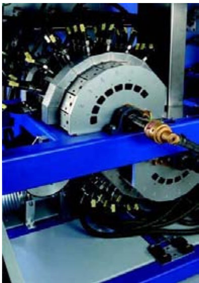
Insgesamt 48 Plasmadüsen in der 2m x 1.50m große Plasmaanlage reinigen das Aluminiumblech beidseitig, kurz bevor Konversionsschicht und Lack aufgebracht werden.

The use of atmospheric-pressure plasma technology in the coil coating process has a major impact on environmental conservation. The relatively small computer-controlled plasma unit measuring 2 m x 1.50 m replaces