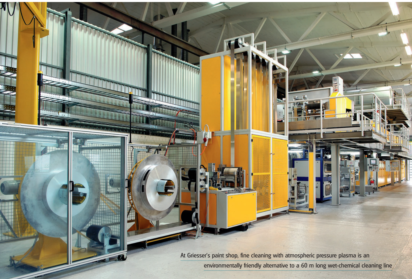
At Griesser's paint shop, fine cleaning with atmospheric pressure plasma is an environmentally friendly alternative to a 60 m long wet-chemical cleaning line

For the past 12 years, an atmospheric plasma technology has enabled a leading solar shading manufacturer to avoid using any chemicals whatsoever for fine cleaning their aluminum strips before coating, and so set an example in environment responsibility.